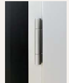
Butt Hinge - S.S. (Series 350-T)

Availability of hinges is based on operator type.