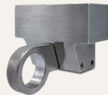
Spring Latch - S.S. (4-Bar Hinges) (Series 450-T & 350-T)