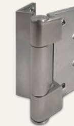
HP Butt Hinge - S.S. (Series 450-T)