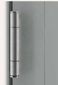
Butt Hinge - S.S. (Series 450-T)