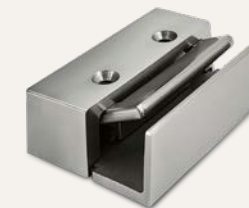
Strike & Latch - S.S. (Series 330-T)