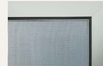
Flat & Sliding Window Screen (Series 450-T, 350-T, 330-T)