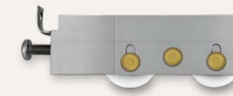
Roller - S.S. (Series 330-T)