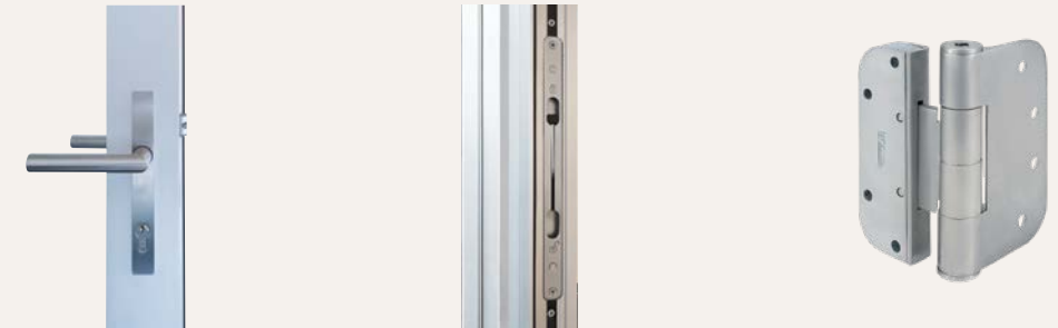
FSB Lever #1076 - S.S. Flush Bolt Latch Adjustable Hinge - S.S. (PVD Finish)