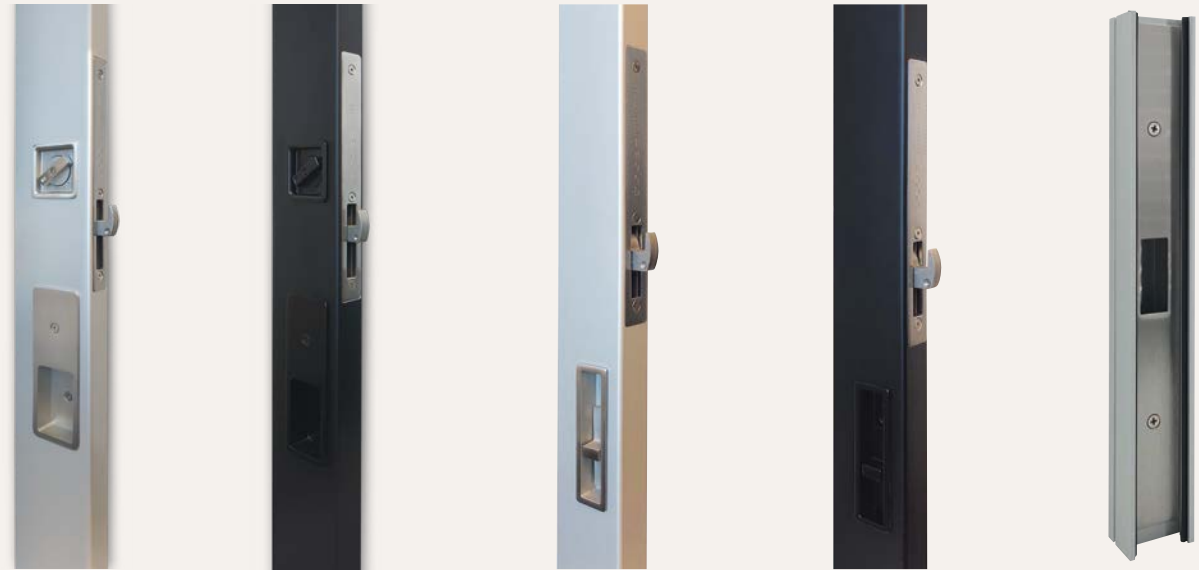
Archetype - S.S. Archetype - S.S. (Black Powder Coat) Archetype Narrow - S.S. Archetype Narrow - S.S. (Black Powder Coat) Strike Plate - S.S.

TRADITIONAL SLIDING DOORS SERIES 3000-T, 3000