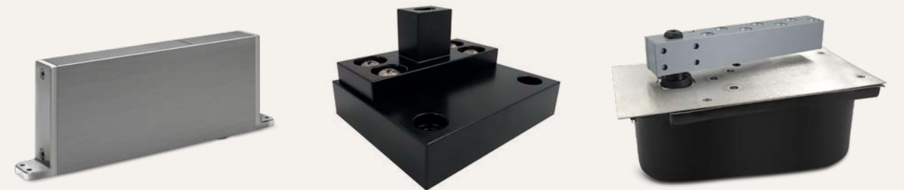
FritsJurgens In-Rail Closer - S.S. Archetype Floor Pivot - S.S. (Black Powder Coat) Rixson Floor Closer