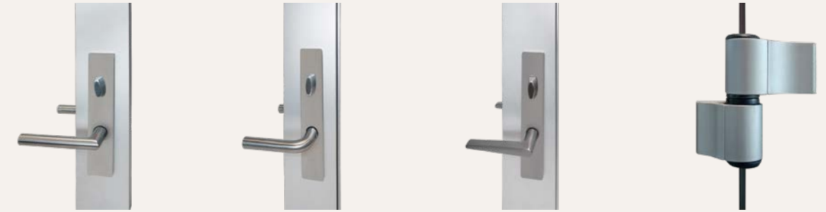
FSB Lever #1076 - S.S. FSB Lever #1075 - S.S. FSB Lever #1005 - S.S. Savio Butt Hinges - Aluminum (Finished to match)