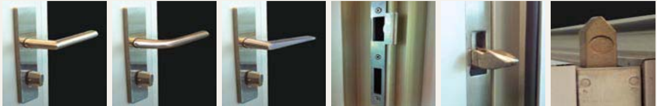
S.S. Lever #1076* (Standard) S.S. Lever #1075* S.S. Lever #1005* Jamb Strike Extended S.S. Levers Brass Shoot Bolt