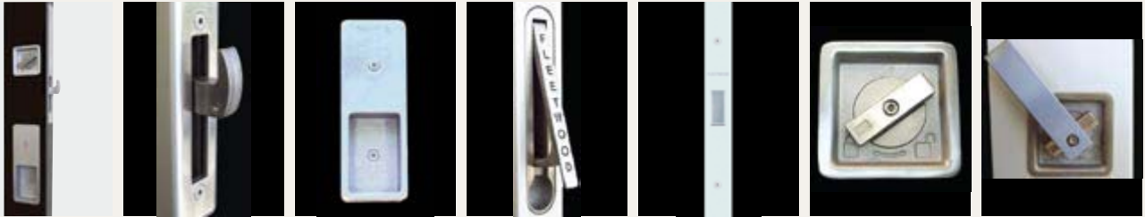
S.S. Archetype* S.S. Latch S.S. Pull S.S. Edge Pull S.S. Strike Plate S.S. Actuator S.S. ADA Lever

POCKET/MULTI-SLIDERS (NORWOOD 3050, 3070-EX, CR, HI-WG) SLIDING DOORS (NORWOOD 3000, GLACIER 3300)