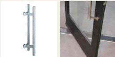
FSB Pull #6615 Floor Closer