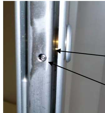
Groove in Key Cylinder Setscrew