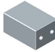
Part No. 20578 Archetype Spacer (1-7/8") Quantity as Required